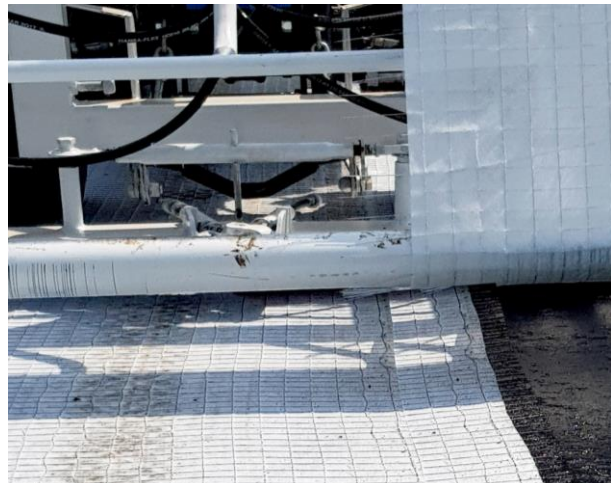
Quick to install and bond, with reduced overlay required

Contact ABG today to discuss your project specific requirements and discover how ABG past experience and innovative products can help on your project.