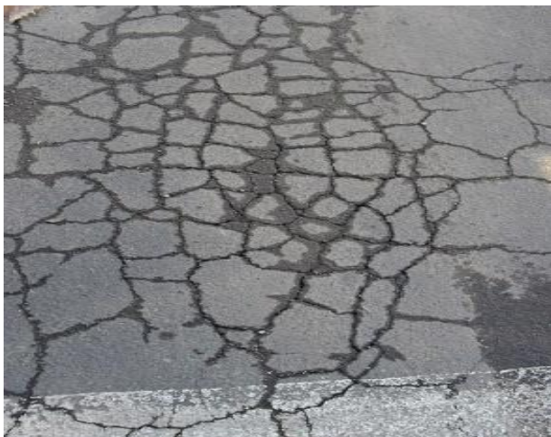
Solution to reflective cracking