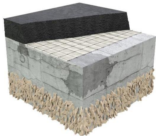
High-strength, low-strain reinforcement interlayer