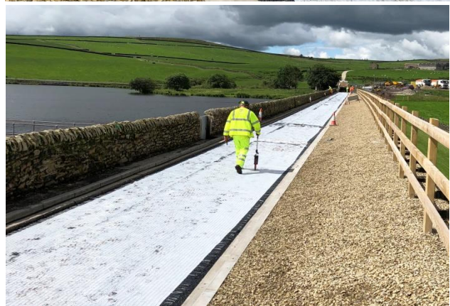
Multibond 70 emulsion coat & Fortifix bond before overlay

Contact ABG today to discuss your project specific requirements and discover how ABG past experience and innovative products can help on your project.